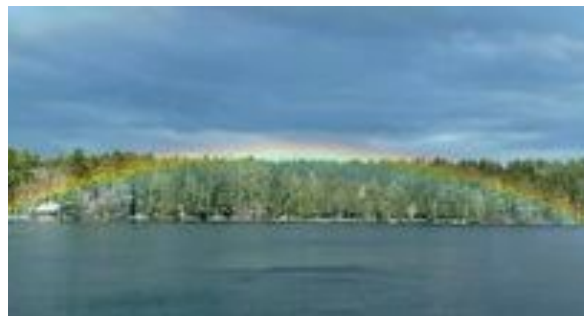
Blaisdell Spring Rainbow

today, and your kids and grandkids involvement too. So much of what we enjoy about the lake is impacted by BLPA and its mission of lake protection via dam maintenance and water quality monitoring and simply by creating a community. All