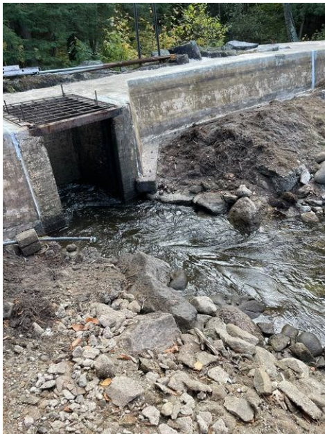
Dam face exposed for maintenance and repair in the fall of 2023

Following the completion of the Instream Flow Study, NHDES has progressed to the next phase: compiling a Water Management Plan. NHDES recently visited Blaisdell to conduct a draw-down test, involving the removal of a board from the dam to measure the flow change. Data collection is ongoing as the process moves forward.